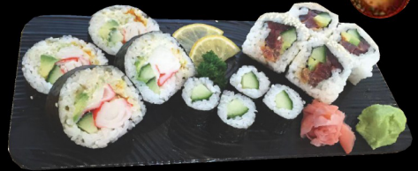
Roll mixed plate

mixed fresh sashimi , salmon, tuna and kingfish nigiri, California rolls and mini rolls serve with miso soup