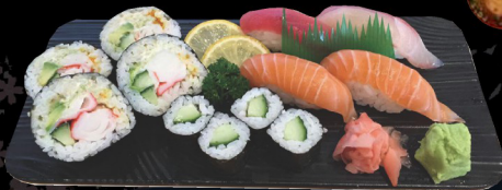
Sushi roll plate

mixed of different sushi rolls serve with miso soup